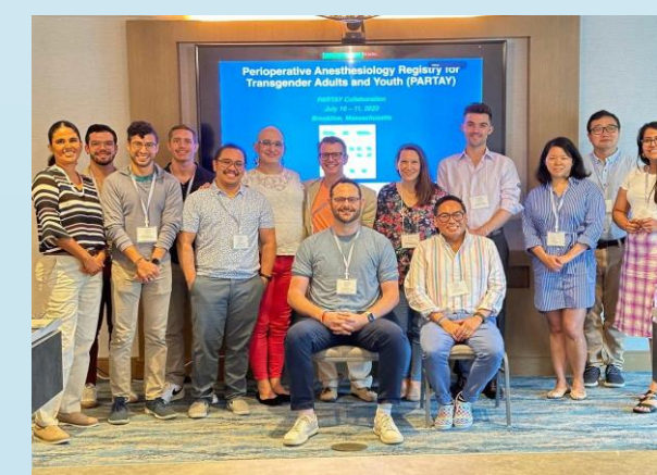
Figure 3. The first research symposium of the Perioperative Anesthesiology Registry for Transgender Adults and Youth (PARTAY) formed in June 2023.