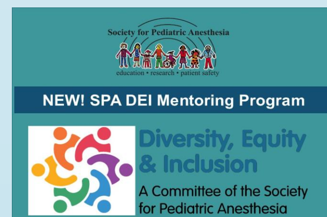
Figure 2. Flier from the Society of Pediatric Anesthesia for a mentoring program recruiting LGBTQIA+ physician mentors and medical student mentees.