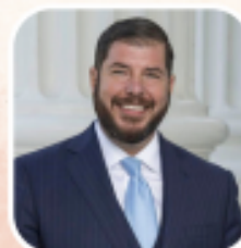
Joaquin Arambula California Assemblymember District 31